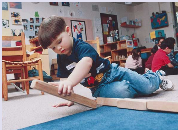
Measuring the perimeter of a rug